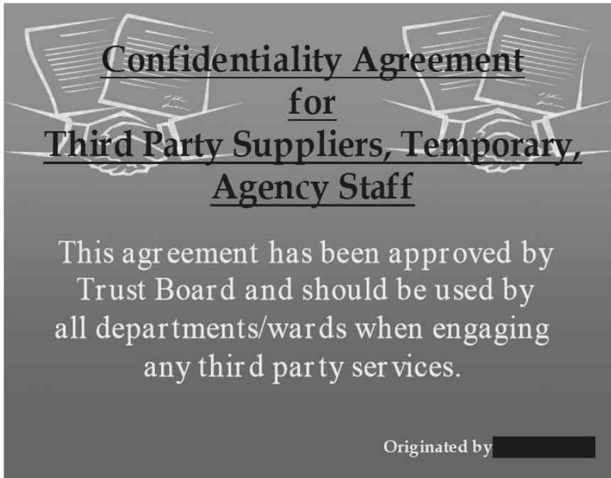
Figure 1 Privacy screen saver