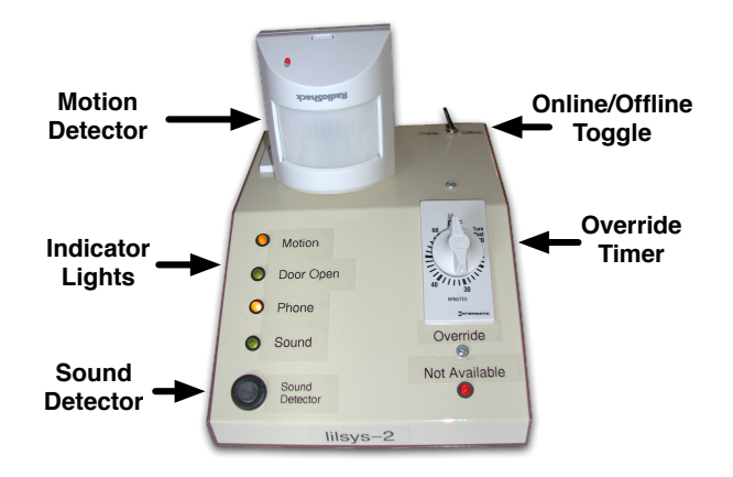
Figure 1: Lilsys sensor and data acquisition module.

To explore the practical issues of inferring availability in an office setting, our research group prototyped a system called Lilsys ,