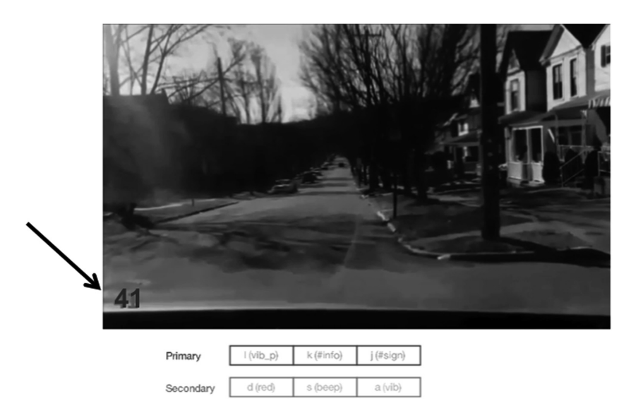
Fig. 1. In this example screenshot, a green number is in the periphery (called out by the arrow here) while participants drove through the scenario (Color figure online).

PT-A was different from the other PTs because the numeric information was presented after the ST was presented. Although this was originally a concern, there were no significant differences in response times (RTs) between PT-A and PT-V/H (Fig. 1).