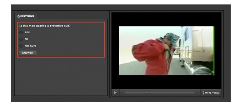
Fig. 1. Screenshot of the prototype interface

For the In context condition queries are presented immediately after the relevant part of the document, which the query refers to, is viewed by the user. In the Out of context condition queries are presented at a point at which the user is engaged with a part of the video which is unrelated to the content of the query, and the Opportune condition accounts for those interruptions which take place at times when the user is not engaged with any particular task or section of the video. In a video annotation system this might be at the boundary between two consecutive shots. Opportune interruptions are generally considered preferable.