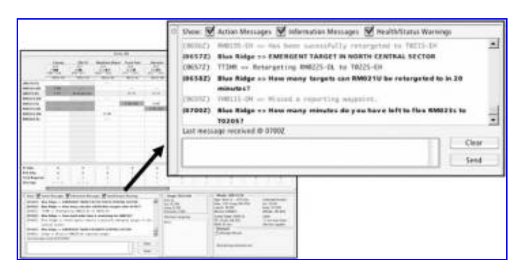
FIG. 2. The Tactical Tomahawk interface for monitoring and retargeting (TTIMR) chat box.

The second performance measure taken through the embedded instant messaging interface was situation awareness. Situational awareness (SA) is generally defined as having three levels, which are (1) the perception of the elements in the environment, (2) the comprehension of the current situation, and (3) the projection of future status.<sup>21,22</sup> While SA can