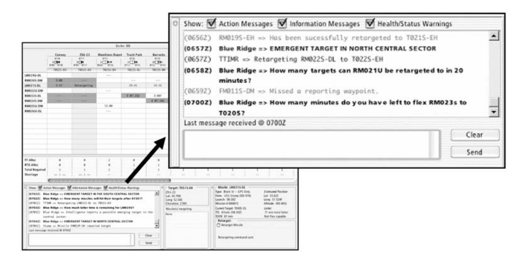
FIG. 2. The Tactical Tomahawk interface for monitoring and retargeting (TTIMR) chat box.

The second performance measure taken through the embedded instant messaging interface was situation awareness. Situational awareness (SA) is generally defined as having three levels, which are (1) the perception of the elements in the environment, (2) the comprehension of the current situation, and (3) the projection of future status.<sup>21,22</sup> While SA can