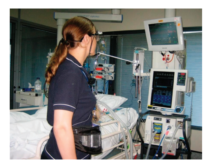
Figure 2. Nurse wearing the mobile eye tracker (glasses with microphone and cameras for scene and eye; on/off switch at shirt collar; recording device and battery in hip bag).

using a spherical model of the eye (Moore et al., 1996), the radius of which was calculated using the calibration procedure in which the subject fixated targets at known gaze angles generated by the head-referenced laser. These algorithms have demonstrated an accuracy and resolution of the order of 0.1° (Moore et al., 1996). The eye tracking method and equipment of the current study has been compared to the scleral search coil technique and has demonstrated closely comparable eye movement recordings (MacDougall, Weber, McGarvie, Halmagyi, & Curthoys, 2009), demonstrating the accuracy of the system. The final result after integrating the eye movement data in the field-of-view video was a 30 frame per second video with a red cross on the screen indicating eye fixation location and length (for information and examples of previous use of the system see MacDougall & Moore, 2005).