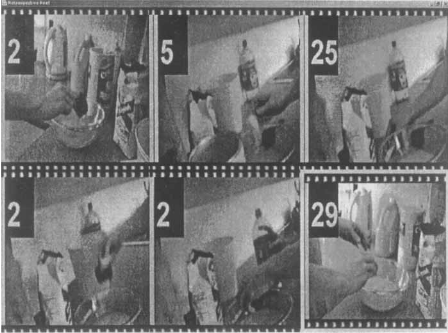
Figure 2. Cook's Collage display

of everyday cooking. The use of unedited raw video accentuates the reality of the cooking experience and personalizes the cooking narrative.